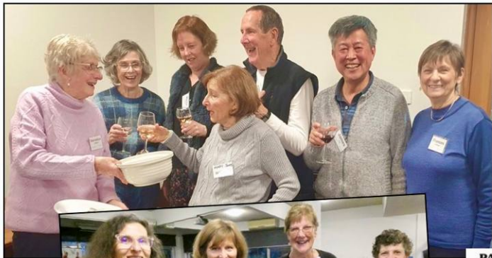
PFGM Southern Team gathering of Parish coordinators and members at Holy Cross, Templestowe on July 31, 2024

We also acknowledged that travelling from other towns may be difficult for some FG members due to age and cost.